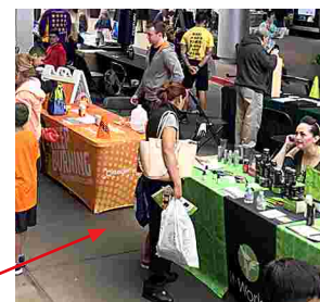
Exhibit Space: 8 x 8 space, includes one 6' table and 2 chairs

Must Bring a Table Cloth Standard: 90" x 132"